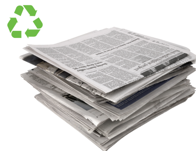
NEWSPAPER Clean & Dry