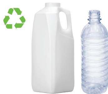
PLASTIC Bottles & Jugs 1, 2 & 5