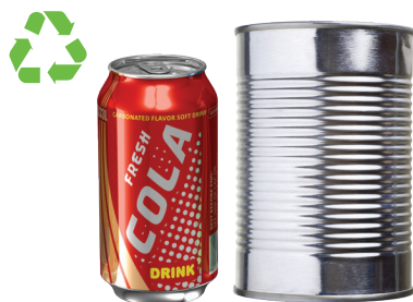
CANS Aluminum & Steel