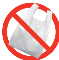
NO Plastic Bags