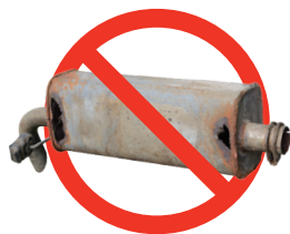
NO Scrap Metal