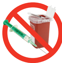
NO Medical Waste