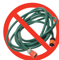
NO Garden Hoses