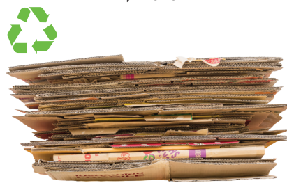
CARDBOARD Dry & Flattened No Food Contact